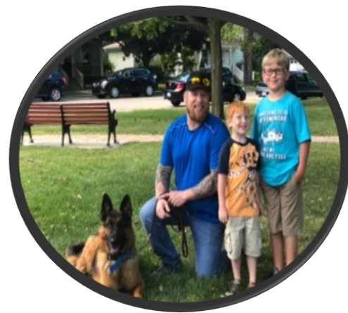
Psychiatric Service Dogs