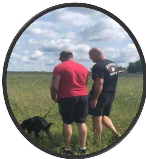
Mental Fitness Coaches